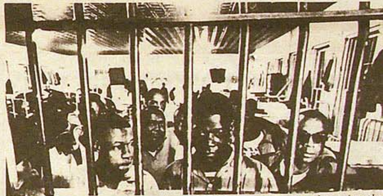
Blacks fill U.S. prisons in disproportionate numbers and receive the worst treatment once inside.