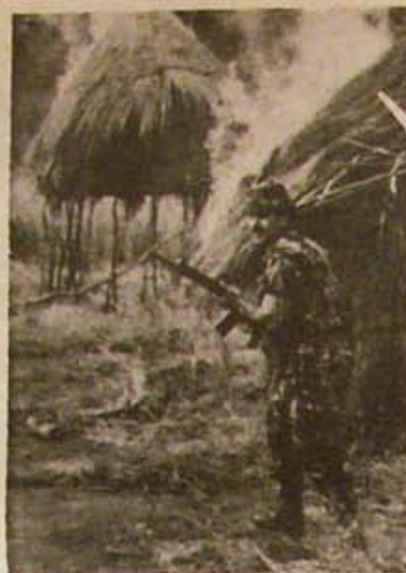
Burning village, above, is typical of Portuguese Army's atrocities in Mozambique.

Several children were captured, including 8½ year old Tembo Lole and they were questioned by agents of the PIDE-DGS who wanted to learn whether their parents gave food to the freedom fighters and whether freedom fighters had