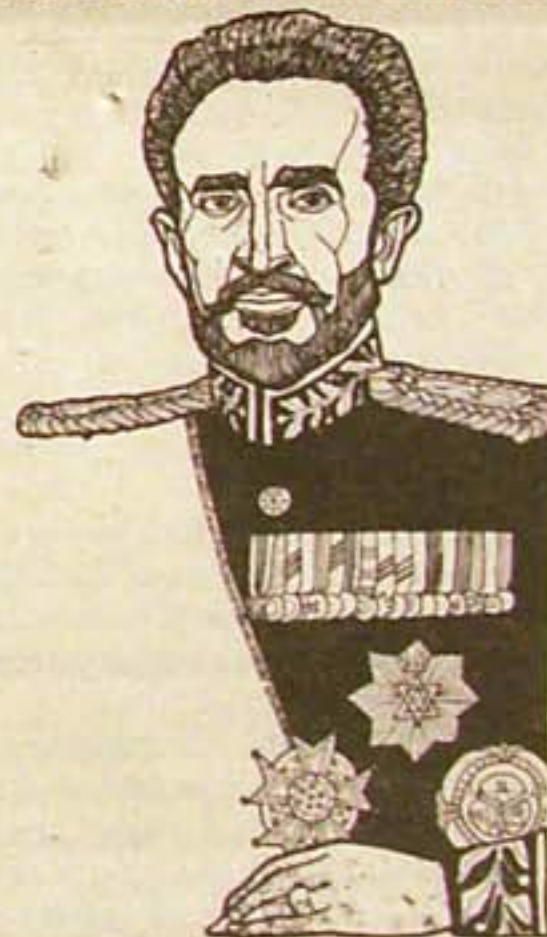
Ethiopian Emperor HAILE SELASSIE.

The Ethiopian armed forces first made its bid for change when, on January 12, a division mutinied for better conditions and increased pay. This action set off a chain reaction throughout the country and won the overwhelming support of the masses of the Ethiopian people, many of whom were suffering untold hardship because of widespread famine which the ruling elite was at worst ignoring and at best poorly administering to. □