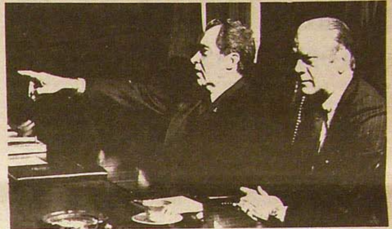
Perhaps anticipating his early demise, RICHARD NIXON, forced to leave office for his numerous crimes against the American people, shows President GERALD FORD the way to stay in office.

Successor Ford's address before the joint session of Congress on August 12, completed Nixon's "farewell to the nation" two days earlier. They were two parts of a