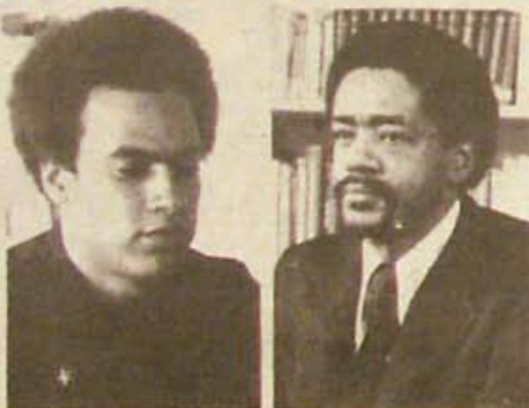
HUEY P. NEWTON