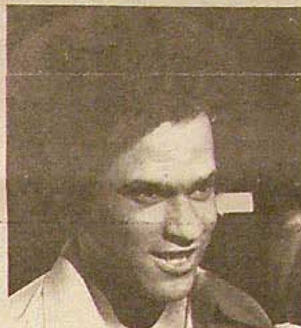
Black Panther Party leader HUEY P. NEWTON.

Disregarding repeated assurances given to all police departments of the Bay Area by Black Panther Party attorney Charles Garry that any member wanted by the police will be produced following proper legal steps, other units of Oakland police made a mass assault on the Jimmy's Lamp Post Restaurant and Bar in downtown Oakland.