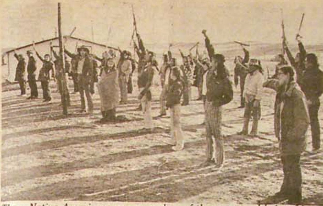
These Native Americans are exemplary of the new stand being taken by Indians in their "Declaration of Continuing Independence"—the demand for recognition by the United Nations.