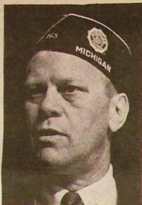
"King Richard's" successor, President GERALD FORD.

"This conference directs the Treaty Council to open negotiations with the government of the United States through its Department of State. We seek these negotiations in order to establish diplomatic relations with the United States... (in order to) deal with U.S. violations of treaties with the Native Indian Nations..."