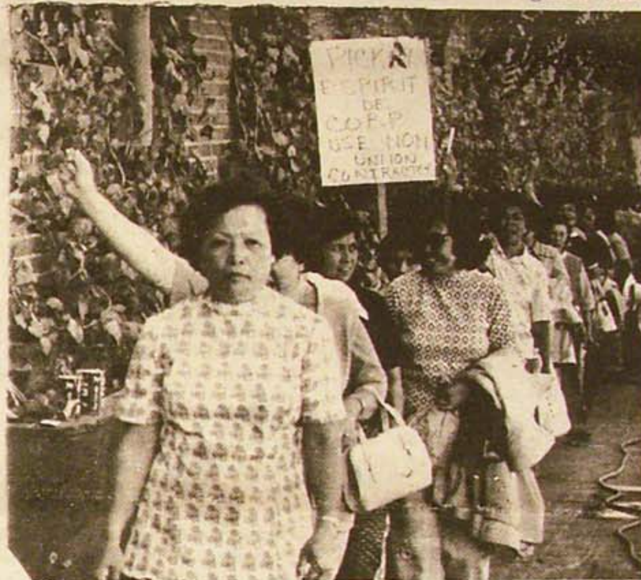
"I'm not striking just for a few dollars or my job... what I'm fighting for is the rights of all Chinese in America, so our people can stand up..."