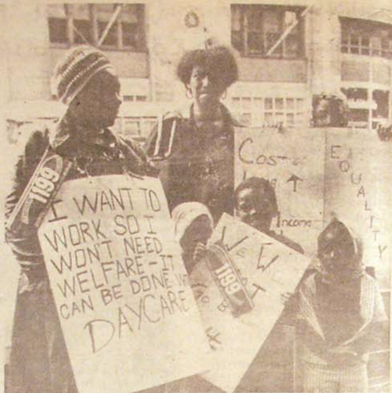
A coalition of community groups in New York City is protesting the city's proposed day care budgetary cuts.