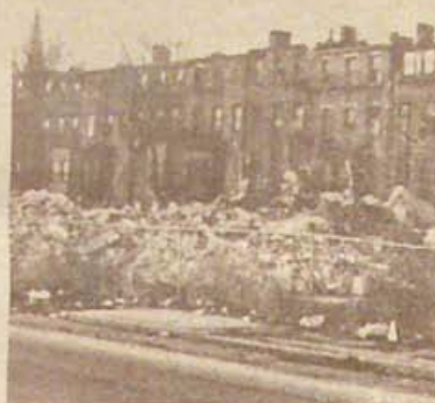
Broken down tenement apartments, like those above, are usually occupied by Blacks and other poor people.