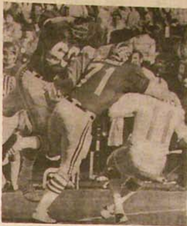
Pro football antitrust laws may change if N.F.L. owners fail to reach an agreement with striking players.