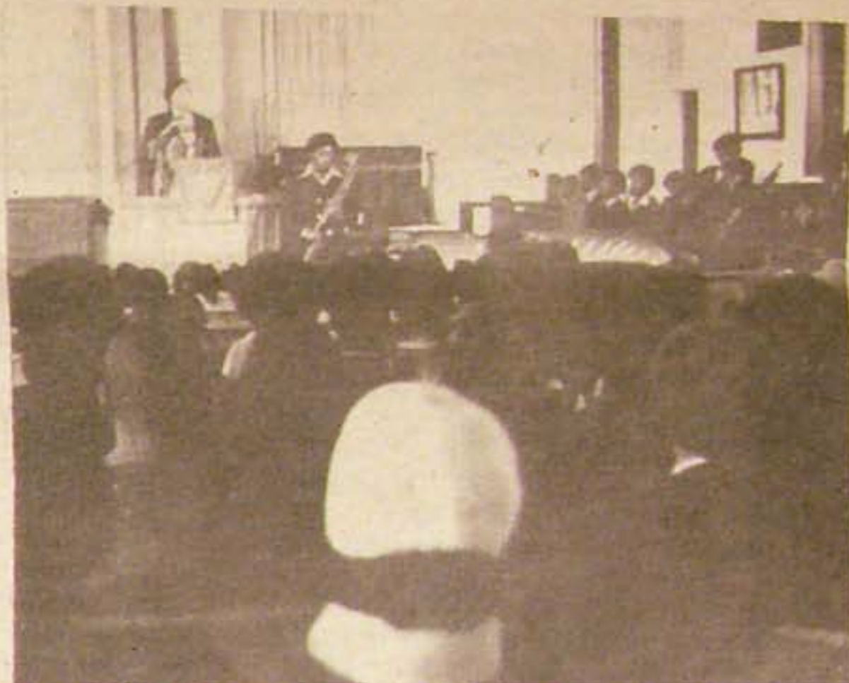
Brother HUEY P. NEWTON (at podium) delivered the eulogy at the Revolutionary Memorial Service for assassinated Black Panther Party Field Marshal George Jackson on August 28, 1971, at St. Augustine's Episcopal Church in Oakland.

Today I say that although George's body has fallen, his spirit goes on, because his ideas live. And we will see that these ideas stay alive, because they'll be manifested in our bodies and in these young Panthers' bodies, who are our children. So it's a true saying that there will be