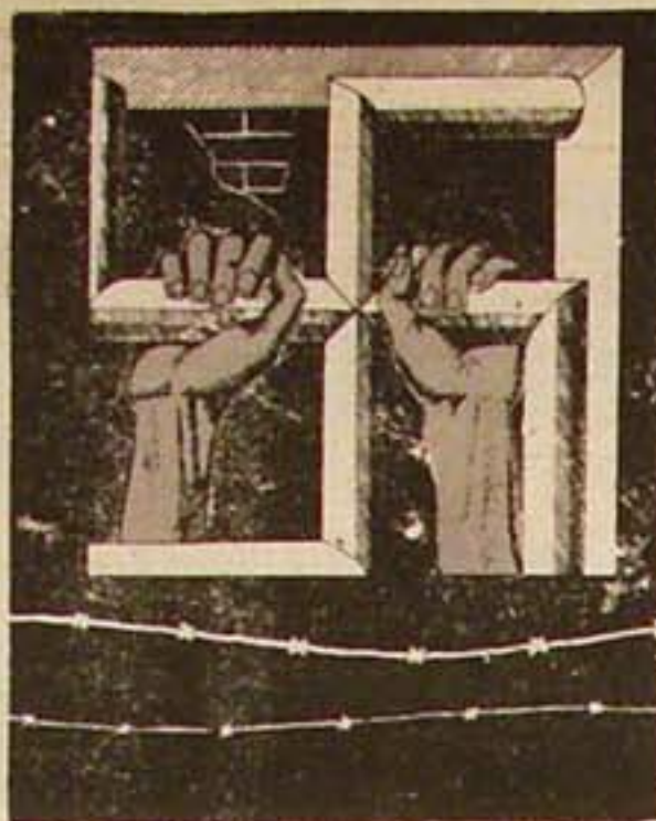
The power structure seeks to blame prison violence on "outside agitators."

The CDC report also neglects the prison staff's contribution to violence and simply recommends increased training for guards, while blaming current prison violence on a "new breed" of prisoner.