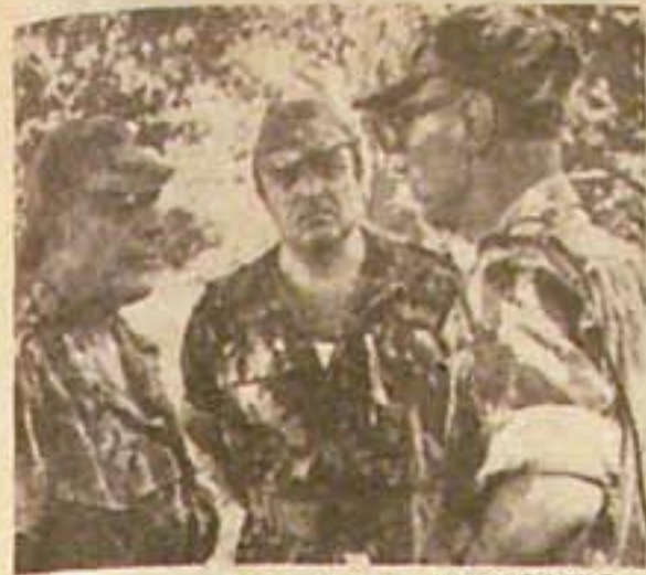
Portuguese President ANTONIO de SPINOLA (left).