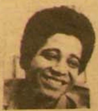
"George Jackson Lives!" See Centerfold.

Central Distribution 8501 E. 14th Street Oakland, Calif. 94621