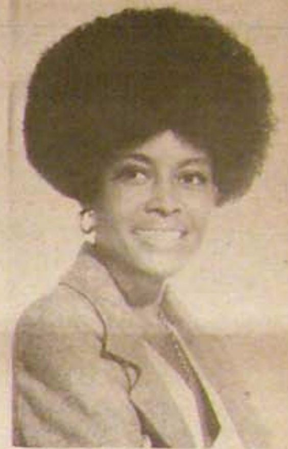
Talented songstress-actress AMINATA MOSEKA (Abbey Lincoln).

The next morning I was there. She presented me to The Honorable Sekou Toure (President of the Republic of Guinea) at breakfast. Some of the cabinet