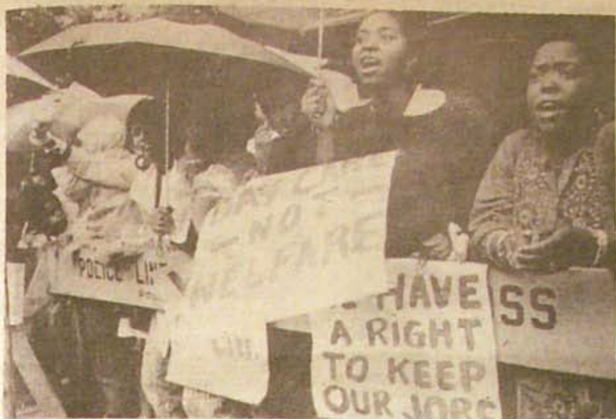
Over 3,000 predominantly Black women and children picketed recently in New York City over proposed cuts in day care spending.